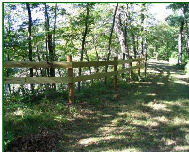
Scene from the Hiking/Equestrian Trail Near the Scenic Overlook